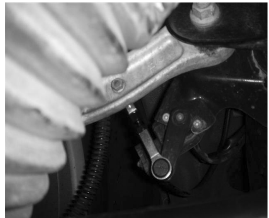
Rear Adjustable Link installed