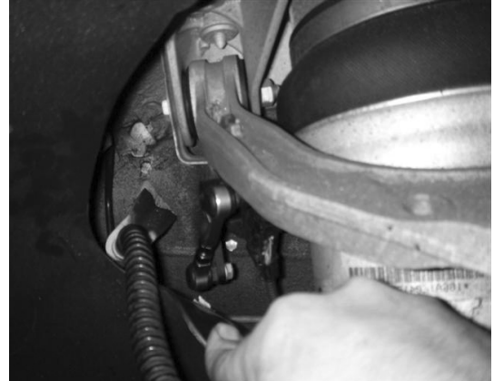
Front Adjustable Link installed