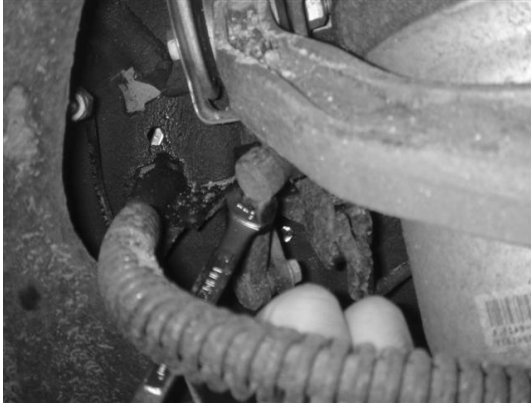
Front Stock Link removal